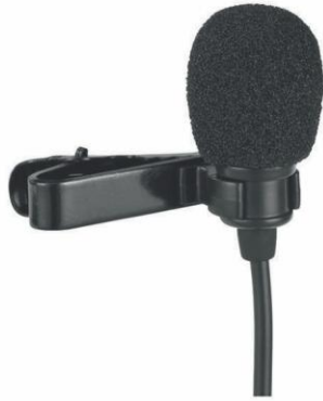
Lavalier microphone with clip