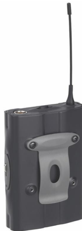
Belt-pack rear view