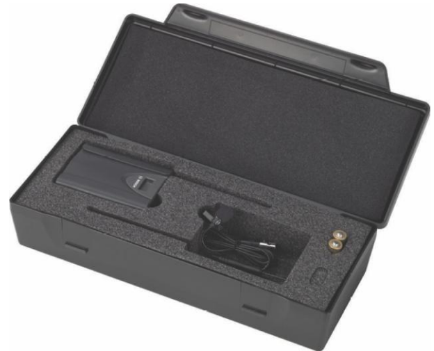
Protective case with wireless, belt-pack and accessories